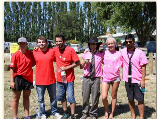
WDC interns competing in the Farmlands Rural Challenge

We were proud to be the principal sponsor of the 2015 Wairoa A&P Show. Wairoa certainly put on great weather and we would like to send our thanks to all those involved in putting together a great show this year. Feedback has been overwhelmingly positive, from the equestrian, to the rodeo to the speed shearing and all the many stall holders. Thank you to all the participants and to the organisers for making this year's A&P show such a great success.