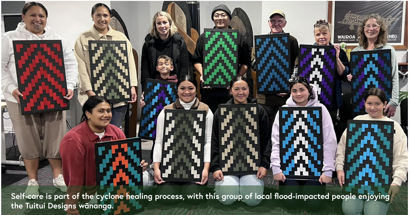
Self-care is part of the cyclone healing process, with this group of local flood-impacted people enjoying the Tuitui Designs wānanga.