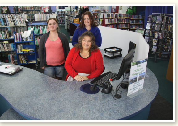
· Library staff enjoy the benefits of a new reception area

Anyone interested in joining the library can do so for free. Visit www.wairoalibrary.co.nz for more information about what the library offers, or call in and chat to a staff member. The library also has a facebook page to keep everyone up to date with events and more.