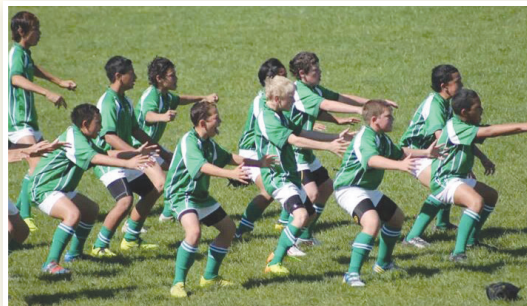
• 2013 Ross Shield team

Upgrade plans for Lambton Square have entered a new stratosphere with a major contribution from Transpower. A successful funding application via the Wairoa Young Achievers Trust has resulted in $30,000 being granted to the project to bring the sports facility up to scratch. Added to the $44,000 already committed by Council, the goal of completing the works in time to host the Ross Shield Tournament in September is now much closer to being realised. The list of tasks includes carrying out repair and maintenance works on the buildings, repairing the existing portable grandstand,