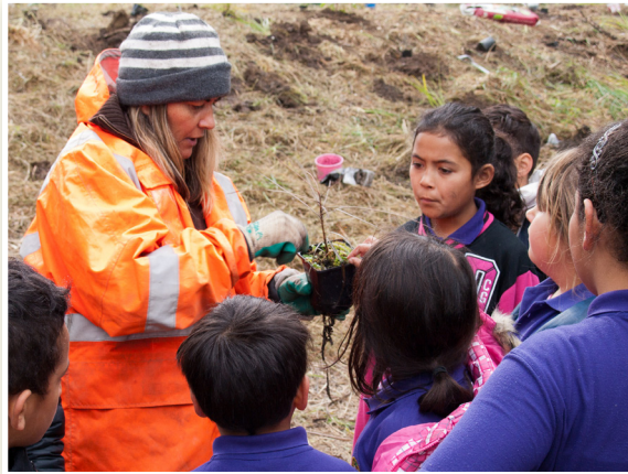
• Children from Te Kura Kaupapa Māori O Ngāti Kahungunu o te Wairoa learn the finer points of planting trees.

Te Kura Kaupapa Māori O Ngāti Kahungunu o te Wairoa ran a planting day to mark the birthday of Sir James Carroll, alongside the walkway that bears his name and leads to the memorial cabbage tree marking the place of his birth on August 20, 1853.