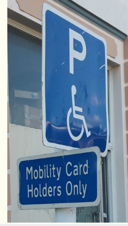
Locke Street, Wairoa