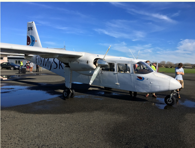
Wairoa Airport was busy recently with multiple charter flights transporting rocket scientists and engineers from Wairoa to Auckland and return.

We had a great turnout of locals and visitors who were eager to see the test launch from the space launch viewing area in Nūhaka.