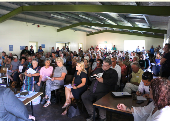
Consultation meeting Nuhaka

I would also like to clarify the "status quo" in this proposal, as many of you have assumed that this means your rates will not increase. This is not the case. The status quo simply means that we continue using the system we currently have in place to calculate your rates. The cost for things go up regardless, i.e. power and petrol and we