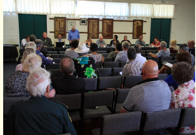
Consultation meeting Wairoa

Councillors and I have made no pre-determined decisions regarding this proposal. We will make our decision once all the feedback is received.