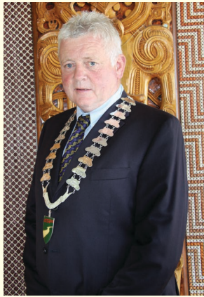
Mayor Craig Little

We still want to hear your ideas about what Wairoa's CBD could look like, and what could do with a bit of sprucing up.