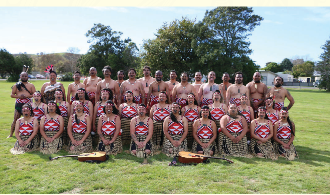
Mātanairau kapa haka aroup photo

WAIROA DISTRICT COUNCIL (06) 838 7309 WWW.WAIROADC.GOVT.NZ