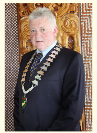
Mayor Craig Little